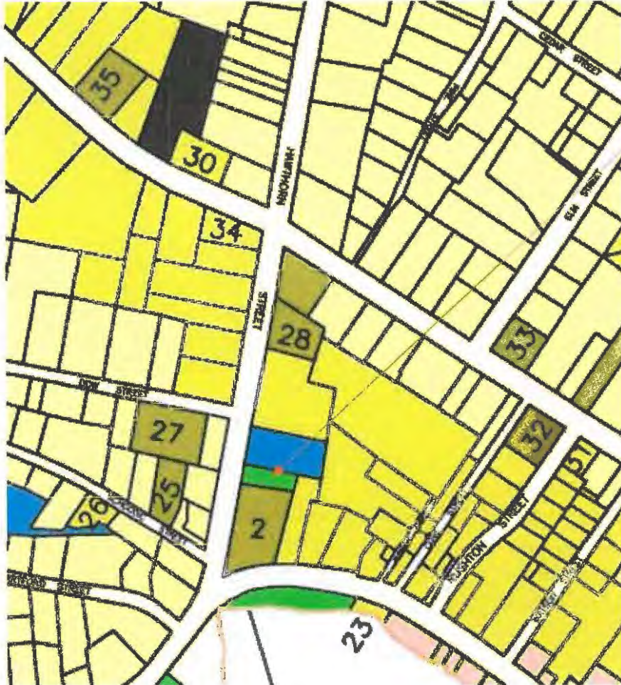
Town of St Stephen Zoning Map