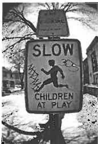
A sign in Urbana, Iowa.

"Children at Play" signs imperil our kids.