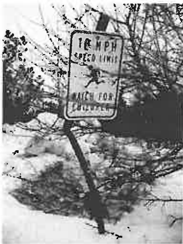
This neighborhood may require another sign telling people to watch for tree branches as well

he's asked about at town meetings.) Residents have also been known to put up their own signs, perhaps using the DIY instructions provided by eHow (which notes, in a baseless assertion typical of the whole discussion, that "Notifying these drivers there are children at play may reduce your child's risk"). States and municipalities are also free to sanction their own signs (hence the rise of "autistic child" traffic signs).