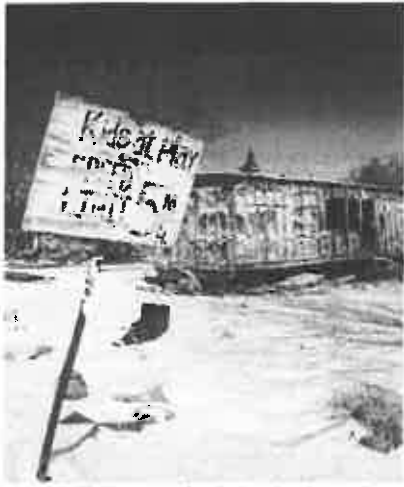
A DIY "kids at play" sign in Niverville Junction, N.Y.

unnecessary use of warning signs tends to breed disrespect for all signs. In situations where the condition or activity is seasonal or temporary, the warning sign should be removed or covered when the condition or activity does not exist."